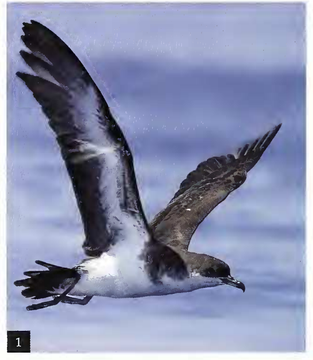
Figure 1. Fresh adult Mohéli Shearwater Puffinus ( persicus ) temptator , with wing score 1, at end of post-nuptial moult (much of body, wing and tail replaced, but several unmoulted inner rectrices), off Mohéli, Comoros, November 2014

Foraging behaviour. - Mohéli Shearwaters forage primarily within mixed-species feeding frenzies, mainly involving Sooty Terns Onychoprion fuscatus (up to 20 in a single aggregation) and Brown Noddies Anous stolidus (up to 230), and, frequently, Masked Bobbies Sula dactylatra (up to three) and Lesser Frigatebirds Fregata ariel (up to five). In addition, HS also identified several Black-naped Terns Sterna sumatrana in these feeding aggregations, with 23 in total. Most of the sizeable concentrations numbered several Mohéli Shearwaters. For example, on 4 November 2014, all nine feeding frenzies included 4-33 shearwaters. First to locate shoals of fish are Sooty Terns and, as they start to dive, Brown Noddies appear with the shearwaters, the latter diving below the